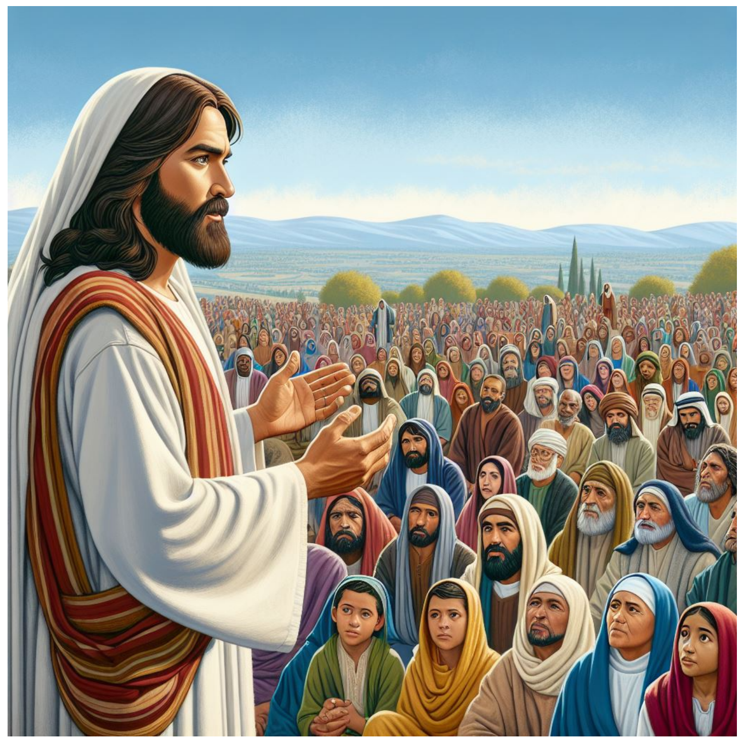
2024 Year 10 Religious Education Test